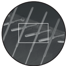
1. Nanowire growth (TU Eindhoven)